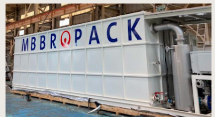
Japan Industry: Municipal Commissioning Date: 2022