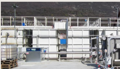
Italy Industry: Food & Beverage Commissioning Date: 2013