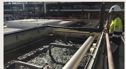
Spain Industry: Oil & Gas Commissioning Date: 2017