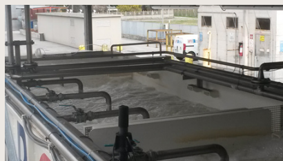
Italy Industry: Pulp & Paper Commissioning Date: 2016