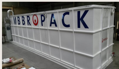
South Korea Industry: Food & Beverage Commissioning Date: 2015